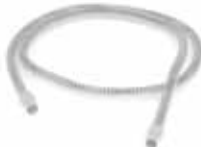
Standard tubing 21948 3 m autoclavable: 14948