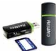
SD card reader 36931 • USB extension cable 7071015