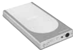
ResMed Power Station II (RPS II - battery only) 24926