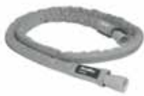
SlimLine tubing wrap 36811