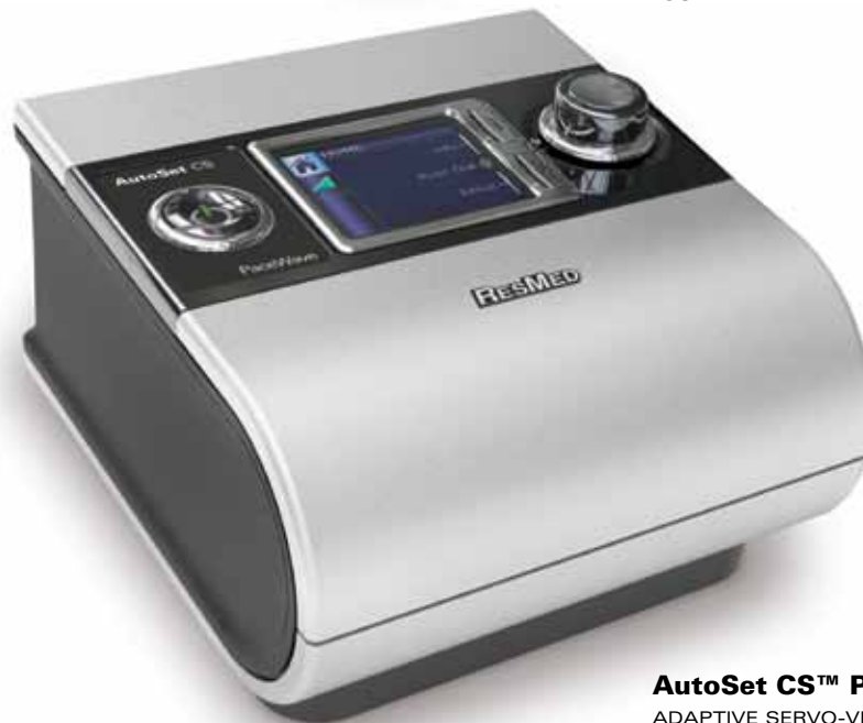
AutoSet CS™ PaceWave™ ADAPTIVE SERVO-VENTILATOR