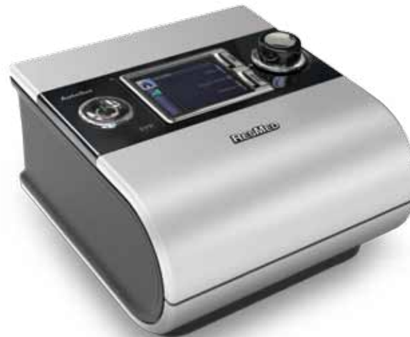
S9 AutoSet POSITIVE AIRWAY PRESSURE DEVICE

1 pack: 36855 2 pack: 36856 12 pack: 36857 50 pack: 36858