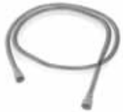
SlimLine™ tubing 36810