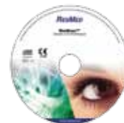
ResScan™ patient management software 31312