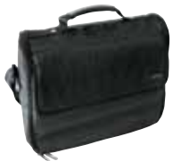
S9 travel bag 36862